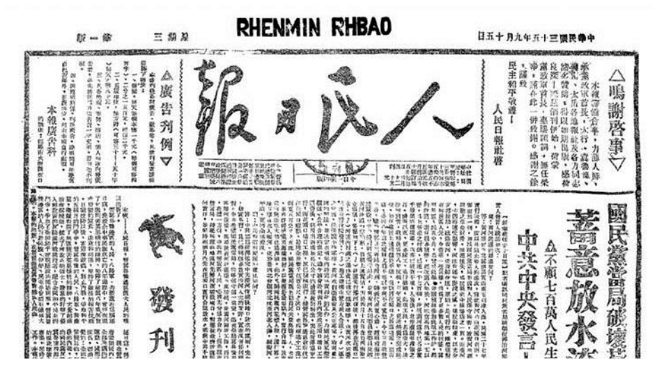
September 15, 1946 edition of Renmin Ribao (People's Daily).