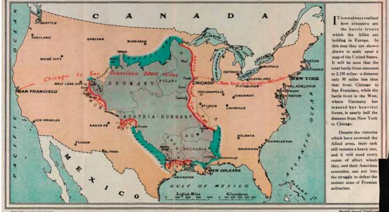
The Battle Fronts of Europe (Edward Stanford Ltd, c. 1917).

The project recognizes a fundamental barrier between researchers and existing digital collections. Too often relying on Google to identify digitized resources, faculty and students alike are challenged by the decontextualized presentation of content, or by database retrieval tools that are either too complex or not granular enough. The project team notes, “Even with relevant sources and adequate context, users may struggle with challenges inherent to primary-source research: foreign languages, document bias, historical usage, grammar, etc. Although all of these issues make it difficult and time-consuming to find and use online primary sources, participants agreed that these sources present a unique educational and research opportunity.” ❖