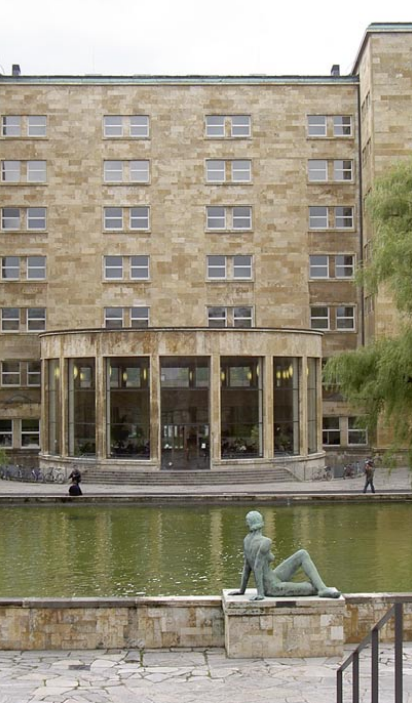
Campus Westend at the Universität Frankfurt am Main, where the symposium was held in October 2006.