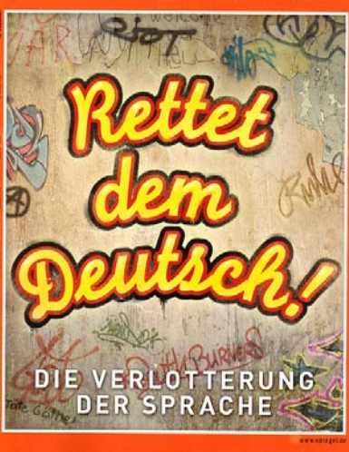
Cover of a recent issue of Der Spiegel (October 2, 2006): “Rescue German! The Decline of [the German] Language.”