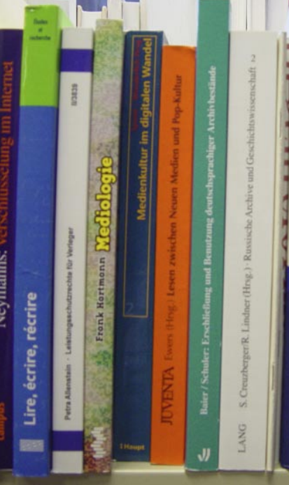
Books from the Frankfurt Fachbuchausstellung awaiting processing in Evanston, November 2006.