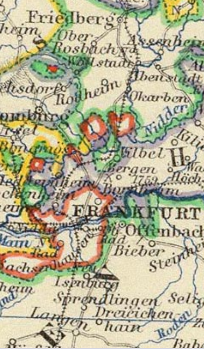
Map from Royal Atlas, 1861, courtesy David Rumsey maps at www.davidrumsey.org .