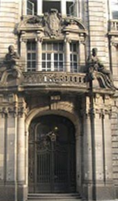
Institut für Bibliotheks-und Informationswissenschaft, Humboldt-Universität zu Berlin.