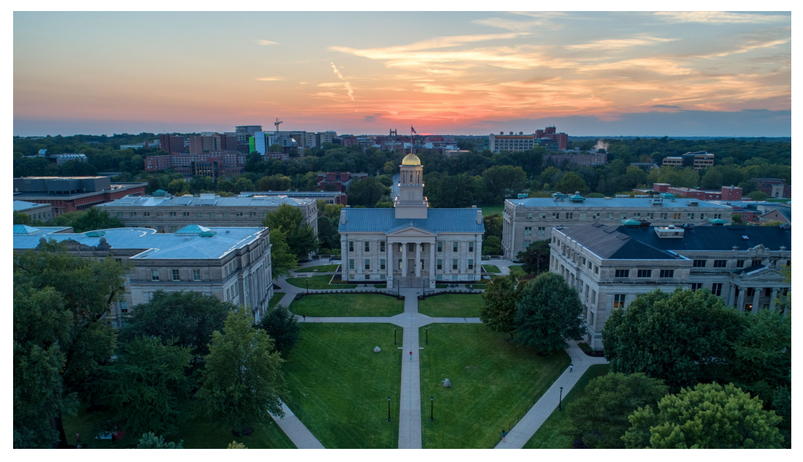
Drone images of campus.