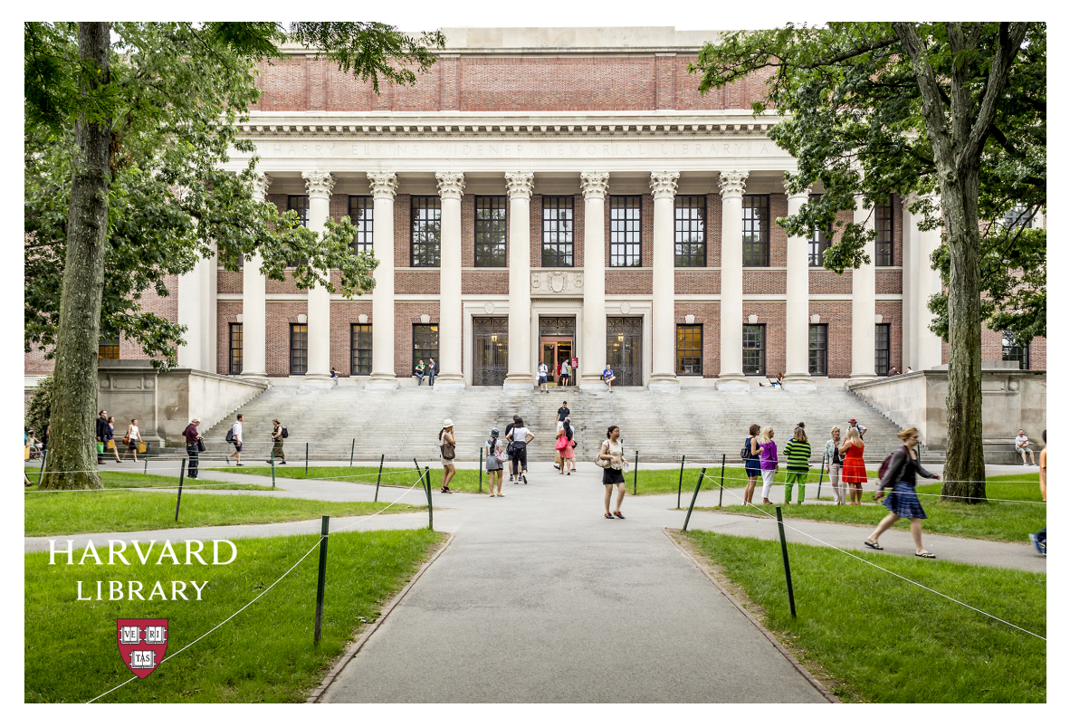
Widener Library at Harvard University

Harvard will host the 2024 TRAIL Annual Meeting, Wed.-Thurs. May 15-16. The meeting will be scheduled from 9-5 during the day for in person attendees. The plan is to record morning sessions that will focus on content and update reports and we will have synchronous hybrid discussions in the afternoon.