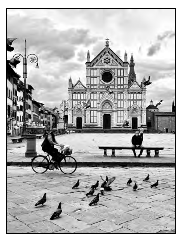
Piazza Santa Croce, Florence, 2020