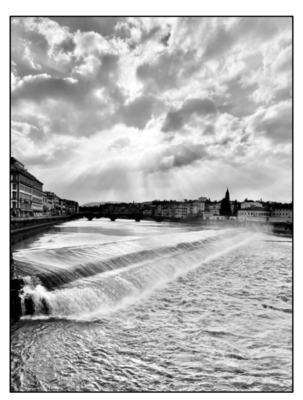
Pescaia di Santa Rosa, Florence, 2020

In conclusion, the New Shape of Sharing: Networks, Expertise, Information online forum provided a platform for collectively teasing out some key areas for potential collaboration for European studies librarians and the vendors and publishers that they work with. Together, we established objectives of creating diverse collections representing the range of political, cultural, linguistic, and scientific production of Europe's past, present, and future; responding to the opportunities of digital resources and new research methodologies; and especially, reaping the multiple benefits of working together to achieve these goals. We hope to continue these discussions with smaller working groups, concrete projects, and increased communication between librarians and vendors in both Europe and North America.