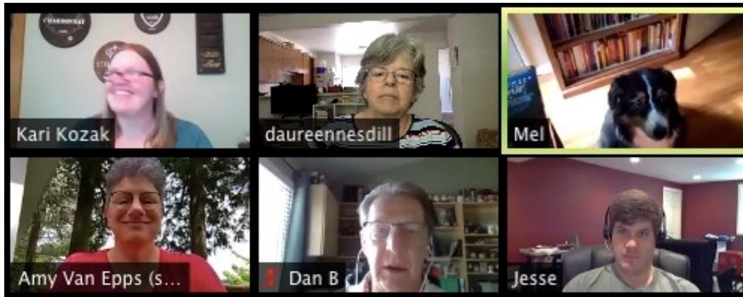
Screen capture from Annual Meeting