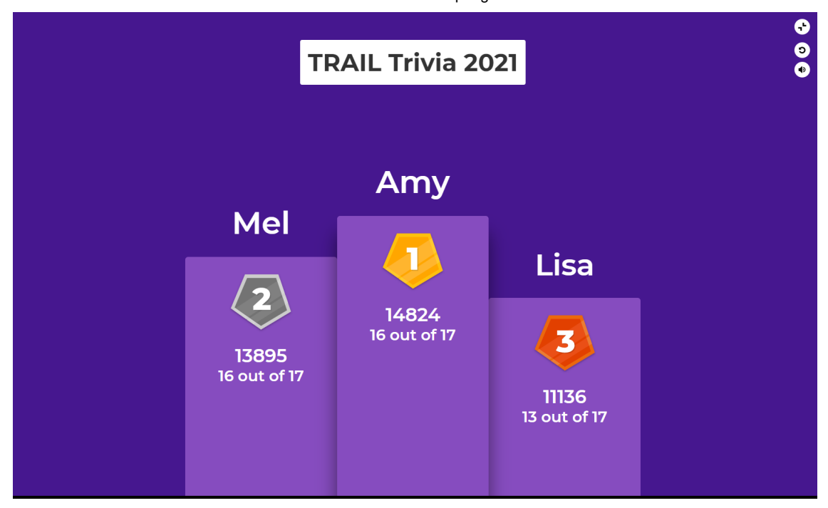
Podium of the winners of TRAIL@15 Trivia.