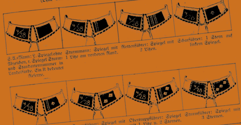
A detail from a 1933 chart of German military collars depicting ranks and insignias for Hitler's Sturm Abteilung , commonly called Storm Troopers.