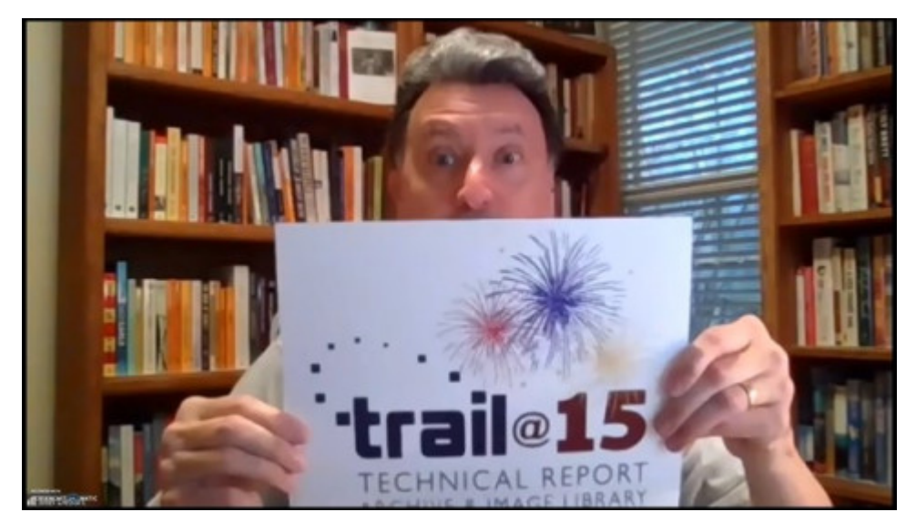
screen shot from TRAIL's video celebrating 15 years of activity