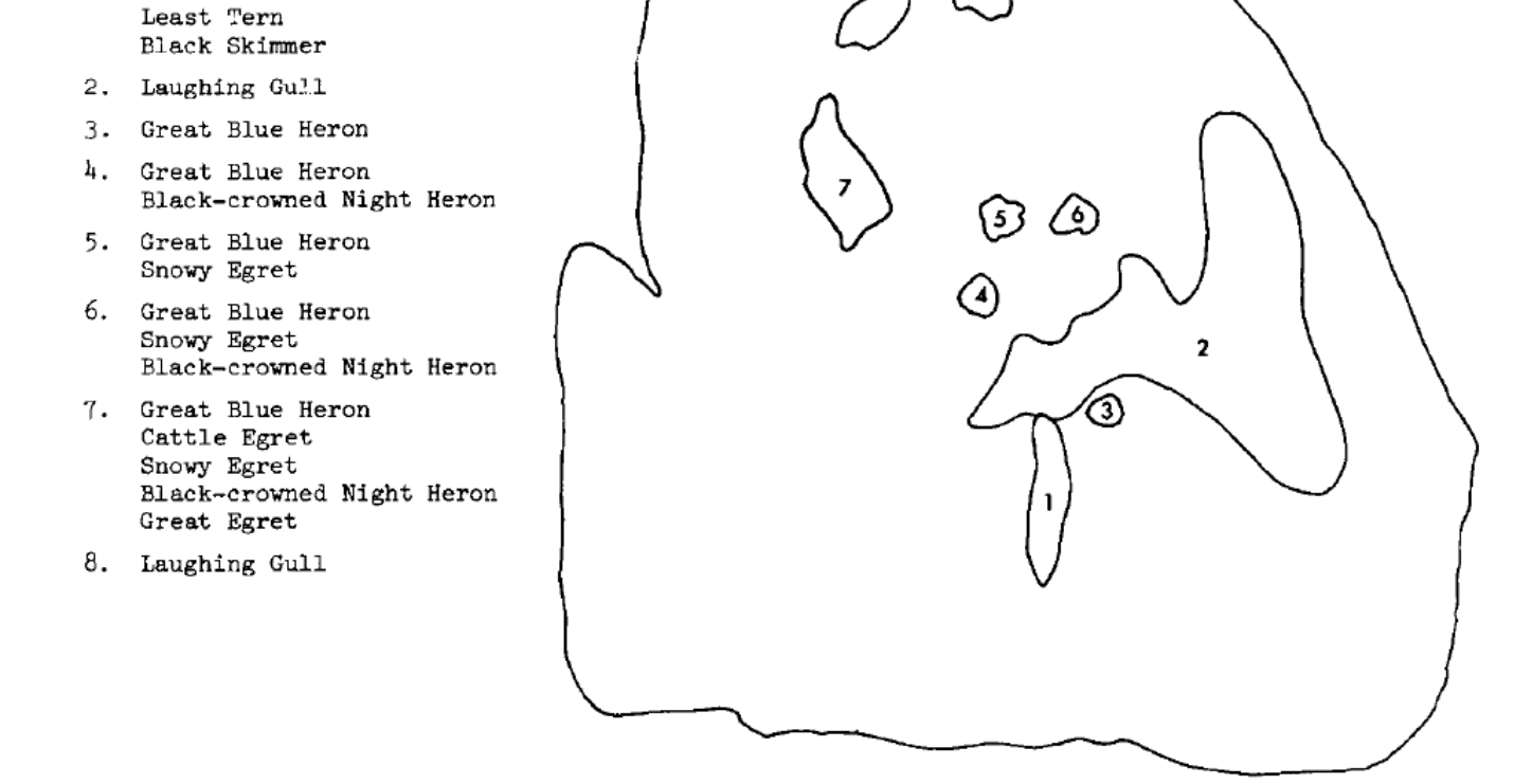
Figure 6. Location and species composition of nesting bird colonies on Island LM 15A.