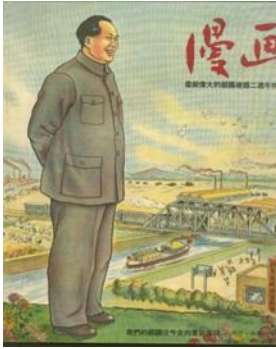
A political pamphlet from the People's Republic of China, 1949