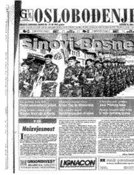
Bosnian nationalist newspaper, Zagreb, 1995