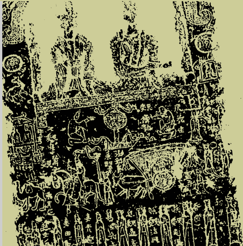
Fig. 121. Ink rubbing of the front side of Wei Wenlang