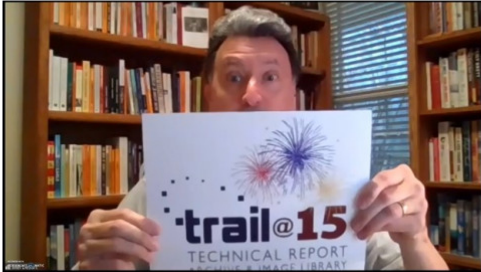
screen shot from TRAIL's video celebrating 15 years of activity