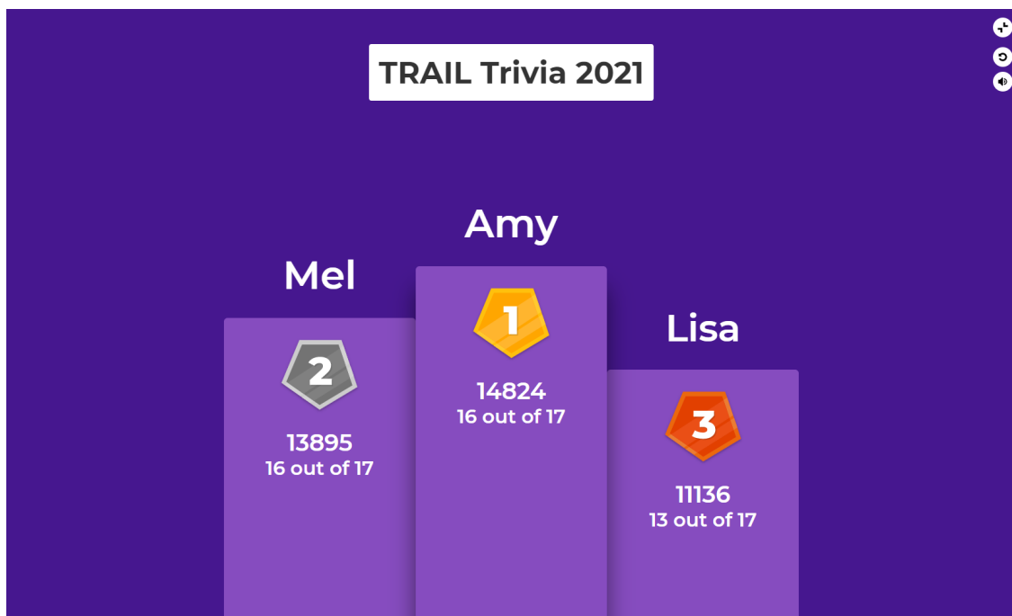
Podium of the winners of TRAIL@15 Trivia.